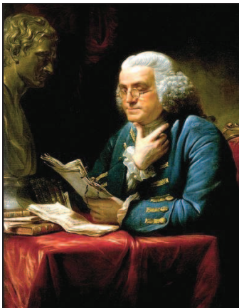
Benjamin Franklin worked on the Articles of Confederation before he helped write the Constitution.